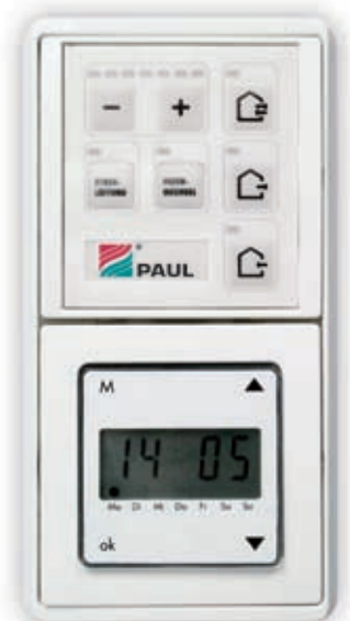
Membrane keypad for manual control with weekday timer (option) within the PEHA switch programme