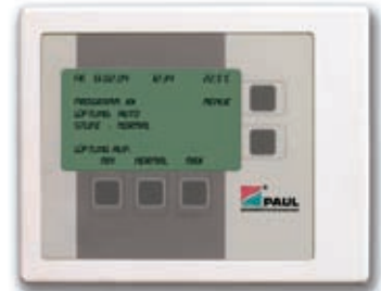
Programmer for automatic control L x W x D (mm): 158 x 125 x 32